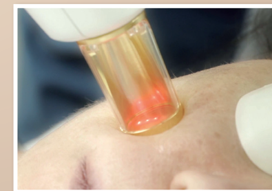
The advanced scanner delivers the laser beams in a precise manner with integrated cooling to ensure maximum comfort.