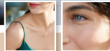
Model not actual patient